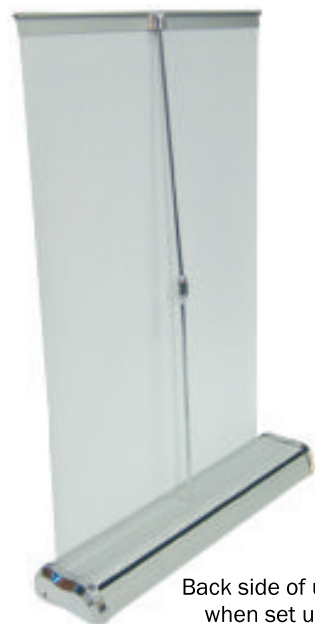
Back side of unit when set up

Banner damage from general long term use, abuse, misuse, letting go of banner or consistent damage with not paying attention when rolling up and down banner is NOT covered under the warranty.