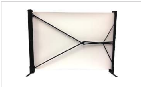
Back fully open

Gently pull open the unit using both hands. Be careful not to open too quickly and be aware of where your image ends.