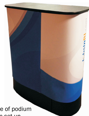
Back side of podium when set up